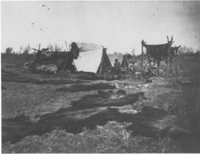
A buffalo hunting camp in Texas.