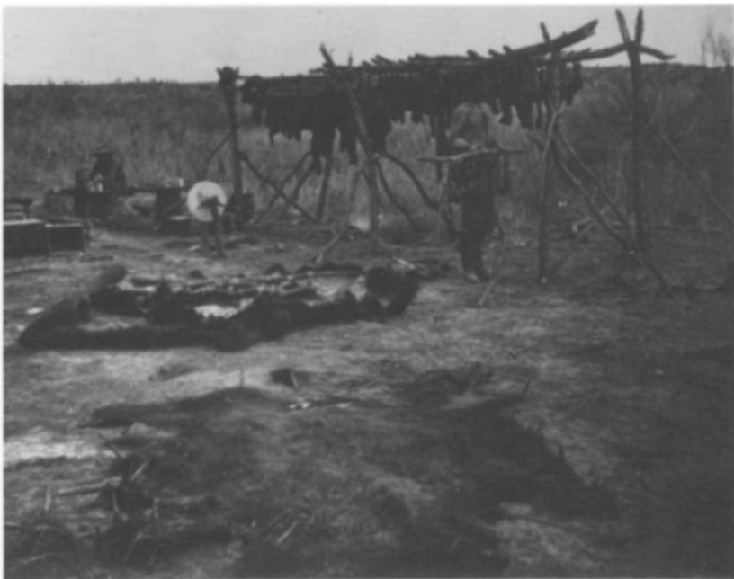
Buffalo hunters camp, Texas Panhandle, 1874.