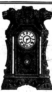
NORWICH CLOCK No. 69

Free for 750 Royal Crown Soap Wrappers or $2.50 and 25 Wrappers.