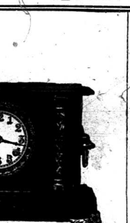
'AIRE' GILT CLOCK

Free for 300 Royal Crown Soap Wrappers or $1.00 and 25 Wrappers.