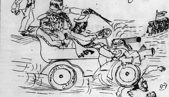
A PICTURE THAT SPEAKS FOR ITSELF