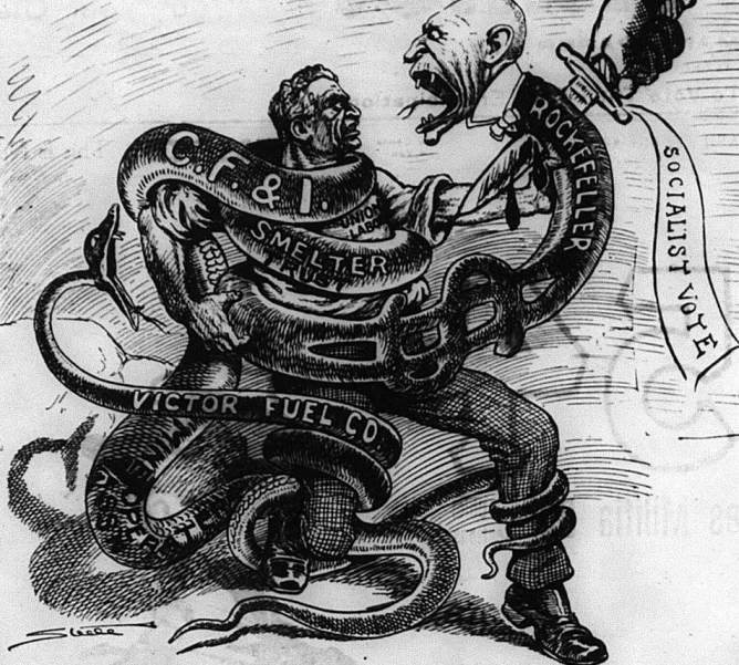
THE COAL MINERS' STRIKE IN COLORADO—DEMANDS AND GRIEVANCES.

Trinidad, Colo., Jan. 21, 1904.—The grievances of all the mining camps in this district are practically the same, for the miners have to deal with the same masters. These grievances are but repetitions of all that have come to light in previous great coal strikes in other parts of the country, and find but a very moderate expression in the formulated demands which the striking miners have presented to the companies. To take as authority the word of those who have had experience in similar strikes, in no mining camps elsewhere has there been worse slavery than here in Colorado.