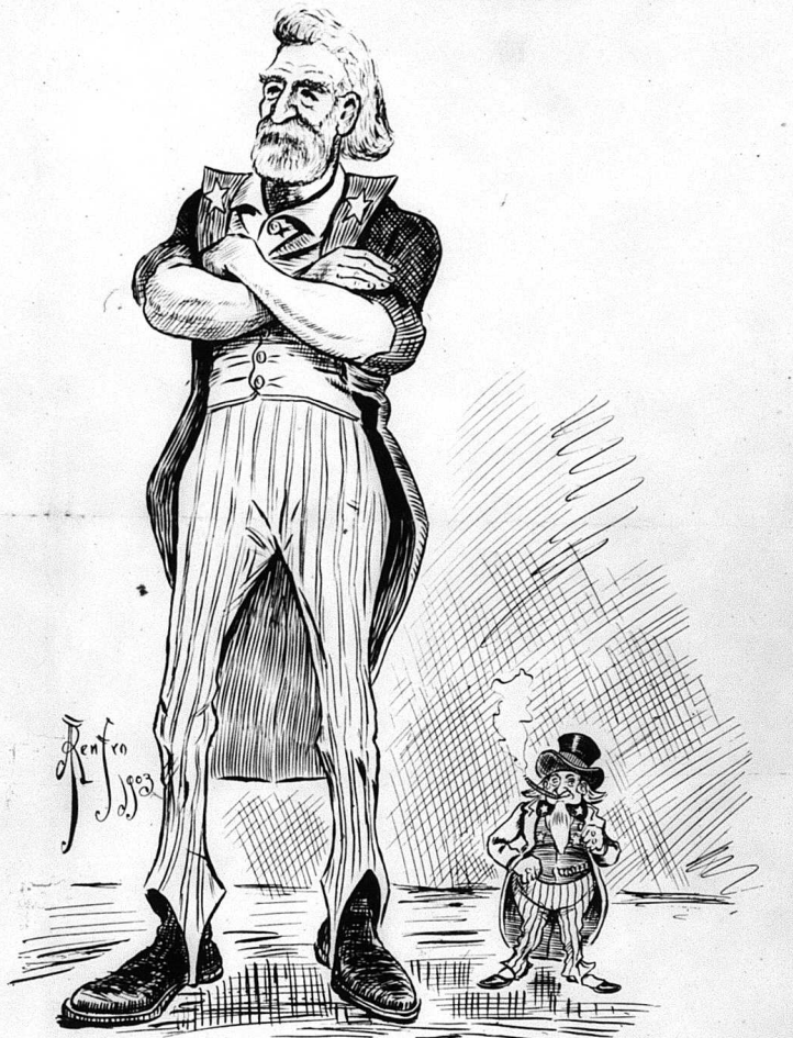
THE ONE WE MIGHT HAVE.

(SEE PAGE FROM SEATTLE DIRECTORY ON OPPOSITE CORNER.)