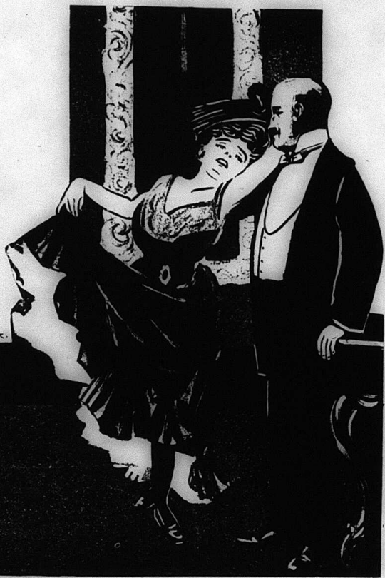
SOCIALIST VICTORIES SPOIL HIS PLEASURES.

(Three million Socialist votes were cast in Germany this summer.)