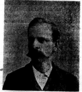
Candidate for Councilman-at-Large.

Born in Massachusetts in 1852, was milking five cows and doing a man's work on a farm, at the age of 12 years. Has been quite a rover, lived in a number of states and territories, and worked at many different kinds of labor, common and mechanical.