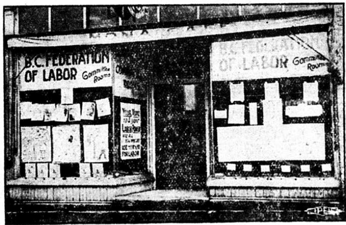
B. C. F. of L. Campaign Headquarters in Victoria

"It is the citizen's duty to obey the law until it is repealed or declared unconstitutional. But he has the inalienable right to fight what he deems an obnoxious law or wrong policy in the courts and at the ballot box."—Senator LaFollette.